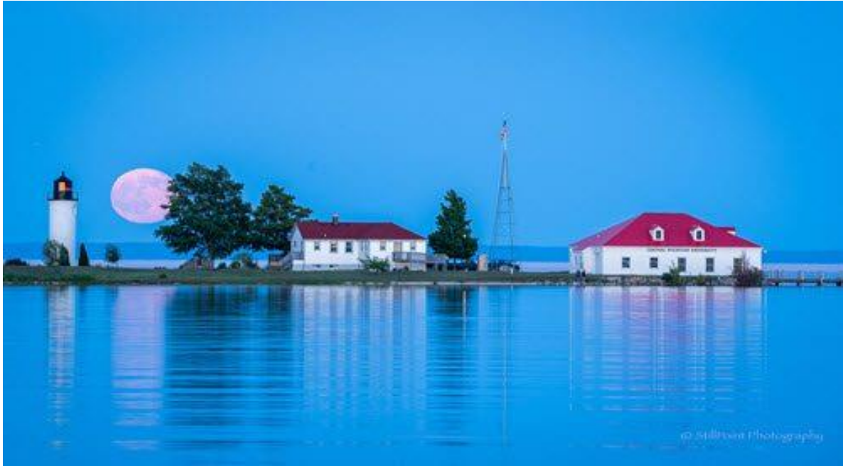
Whiskey Point: Light Tower, St. James Township Hall, Central Michigan University Boat House